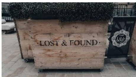
Our Lost and Found Page.

There is a Lost & Found page on our Church Center app. If you haven't downloaded the Church Center app from you app store, do so today. Set-up your account online with our church or reach out to the church office for assistance. Scroll down the home page until you see the image below. Click on "Lost Items". The pictured items and more are in the bin in the admin lobby.